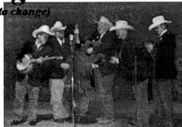
Bluegrass Brothers Hard Driving Traditional Bluegrass (VA)