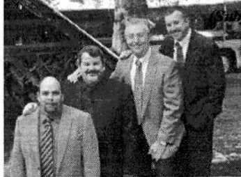
Remington Ryde Entertainment at its best! (PA)

★ Featuring some of USA and Canada's Premiere Bluegrass Bands ★