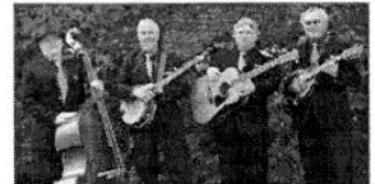
Rhyme 'n' Reason Canadian Bluegrass Band