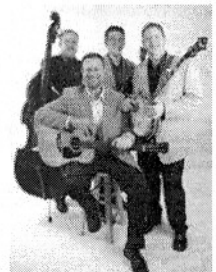
The Spinney Brothers Canadian Bluegrass Band